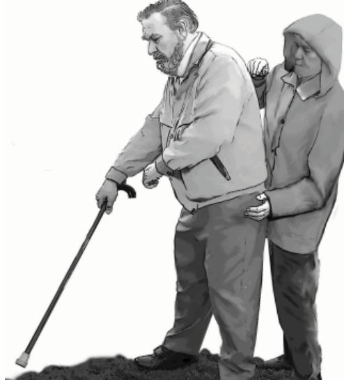
Figures 16 and 17 shows the body continuing to turn and act as a lever and the stick being fully freed. (Don't worry about them grabbing you around the neck or anywhere else, they will have to let go of your stick to do it ).